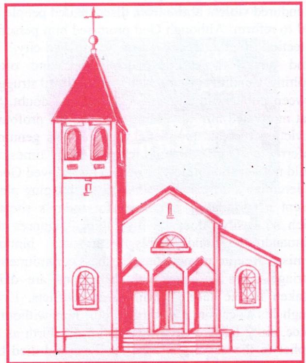
St. Patrick Mission, Port Costa

WELCOME! Our warmest welcome to all who celebrate with us, whether longtime resident or newly arrived in the parish. We thank God for you! If you are not on our parish list—please fill out the form below and place in the collection basket or mail to the office.