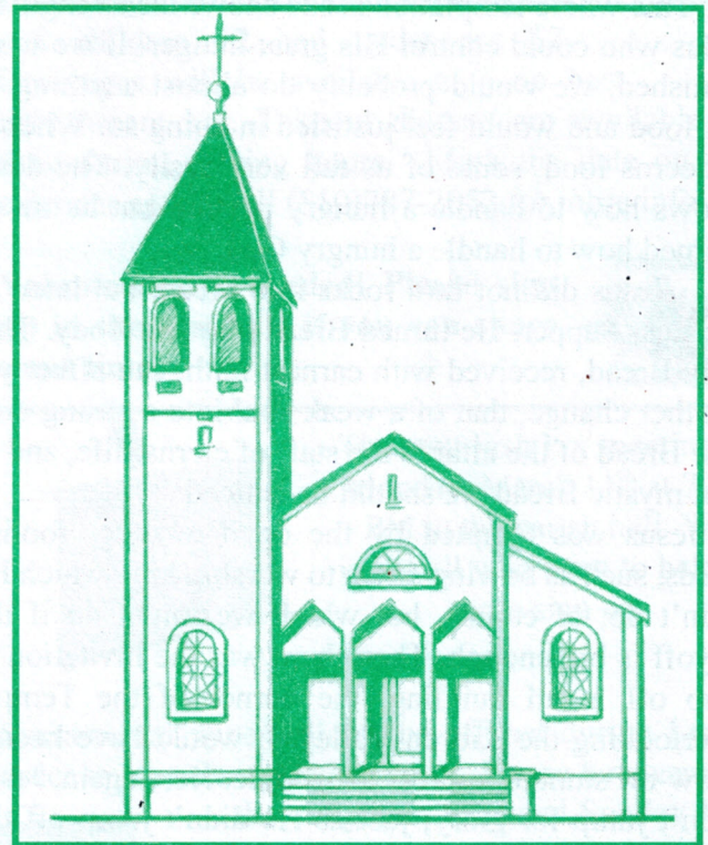
St. Patrick Mission, Port Costa

PASTORAL CARE OF THE SICK: Notify the priest regarding those who are ill, hospitalized or homebound.