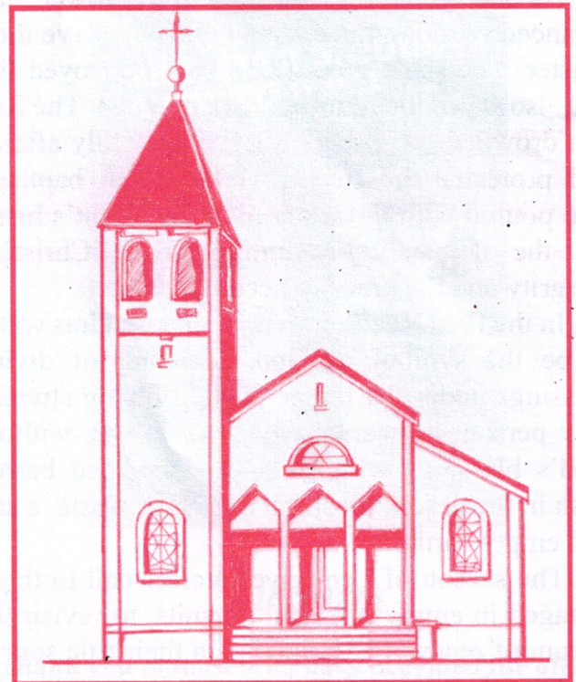
St. Patrick Mission, Port Costa

WELCOME! Our warmest welcome to all who celebrate with us, whether longtime resident or newly arrived in the parish. We thank God for you! If you are not on our parish list—please fill out the form below and place in the collection basket or mail to the office.