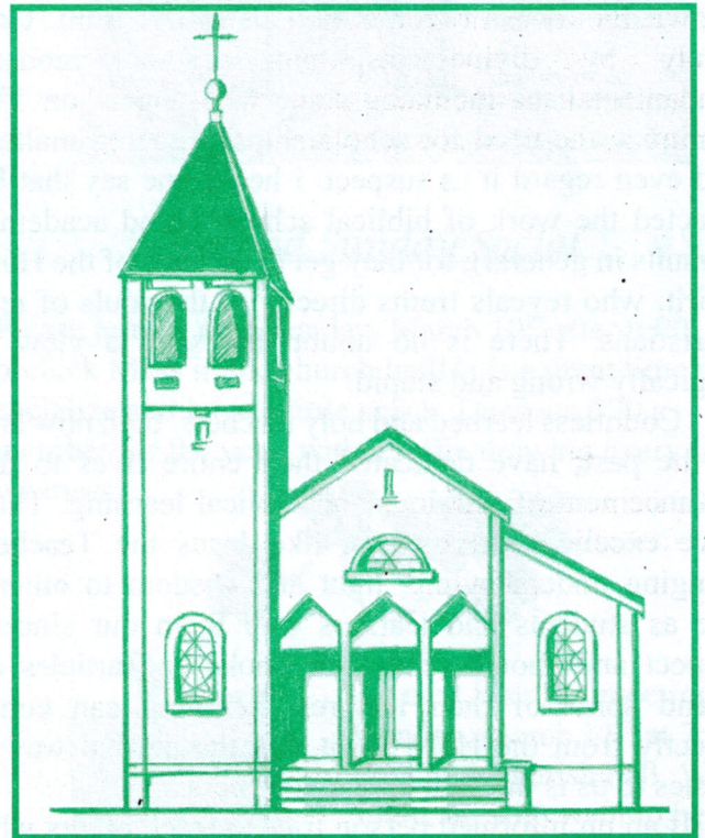
St. Patrick Mission, Port Costa

WELCOME! Our warmest welcome to all who celebrate with us, whether longtime resident or newly arrived in the parish. We thank God for you! If you are not on our parish list—please fill out the form below and place in the collection basket or mail to the office.