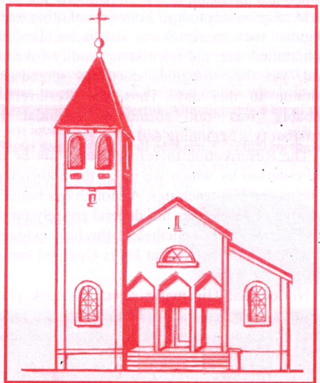
St. Patrick Mission, Port Costa

PASTORAL CARE OF THE SICK: Notify the priest regarding those who are ill, hospitalized or homebound.