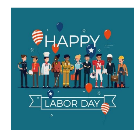
The office will be closed Monday, September 5<sup>th</sup> in honor of Labor Day.